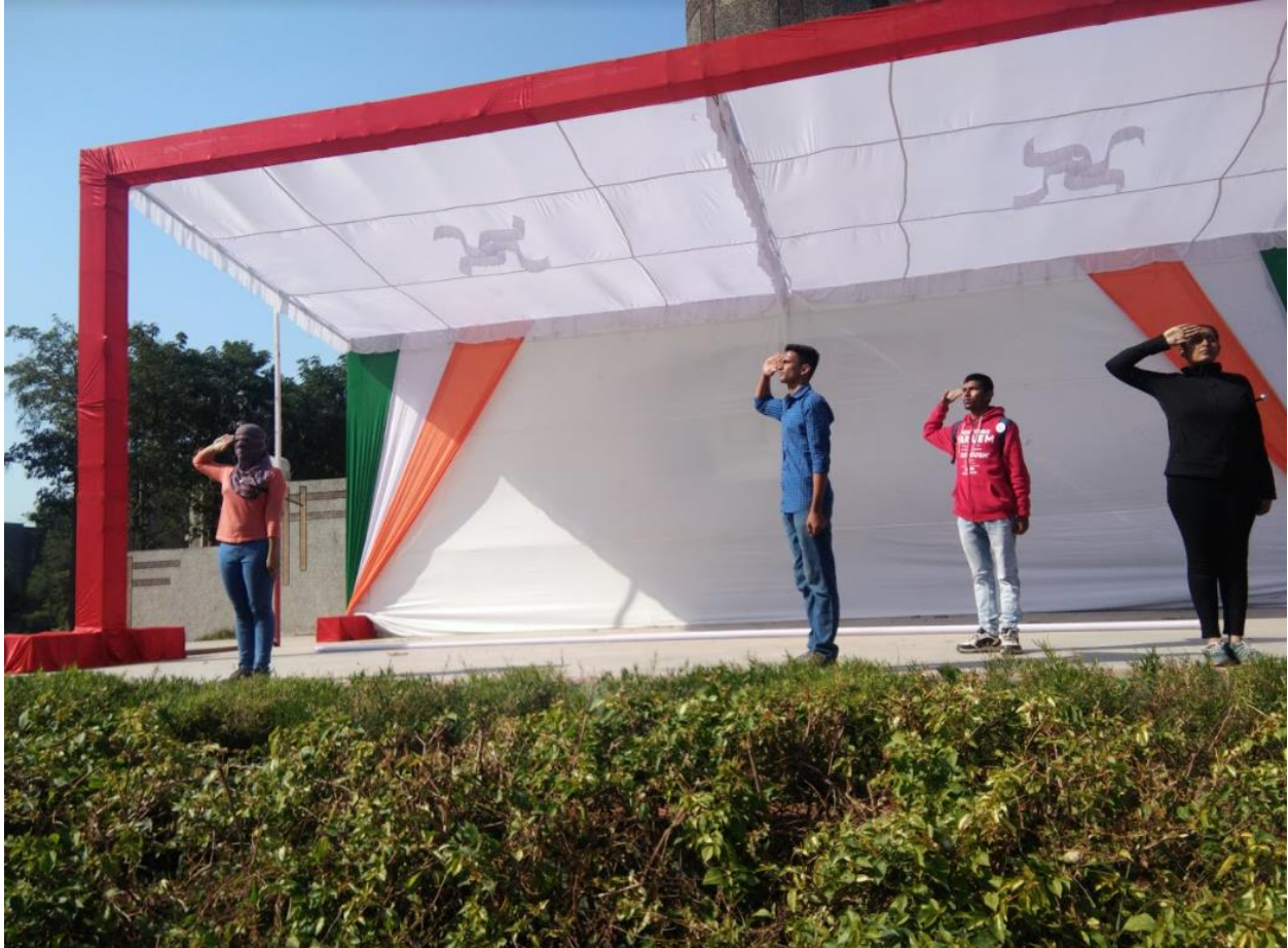
Central Lawn, CHARUSAT Campus