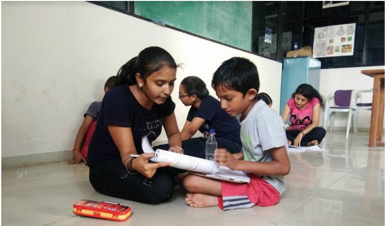
Language Lab, I2IM building

All the students were divided into three groups: Group A: Group A consisted of 123 students of Standard 11 and 12 studying in 4 different rural schools. Group B: Group B consisted of 176 students of Standard 9 and 10 studying in 4 different rural schools. Group C: Group C consisted of 413 students of Standard 5, 6, 7 and 8 studying in 10 different rural schools.