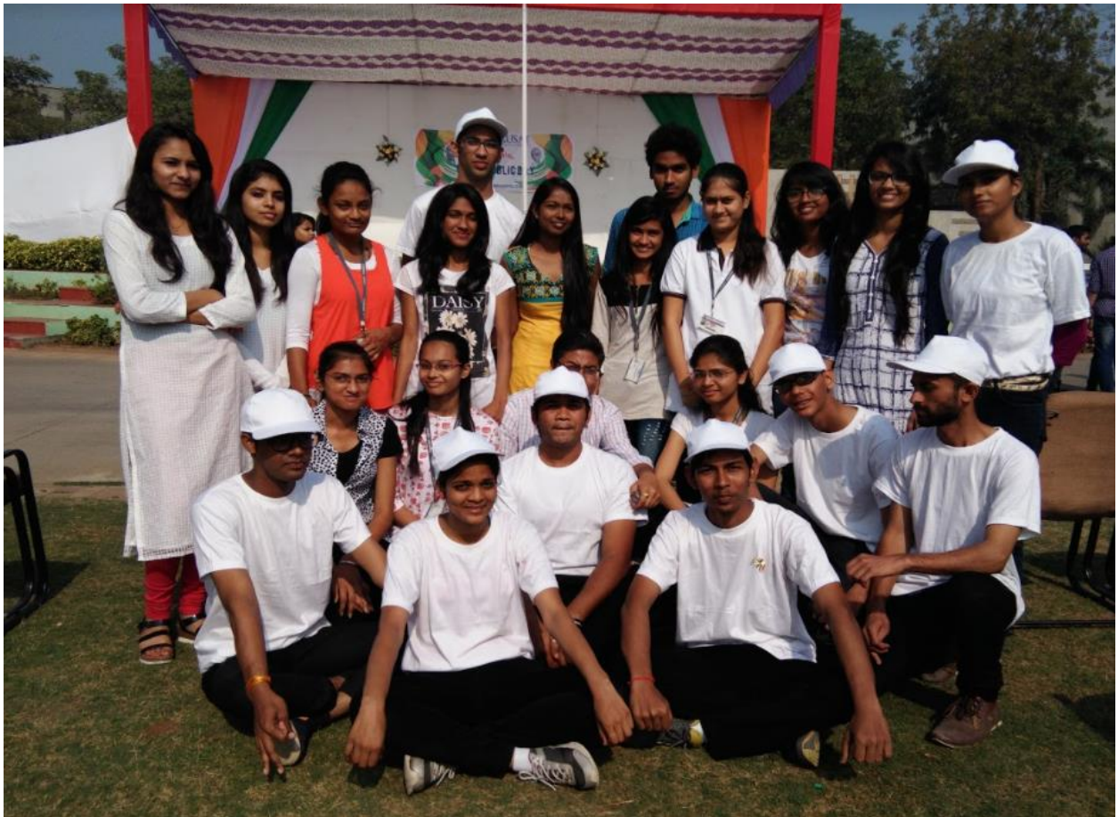
Central Lawn, CHARUSAT campus