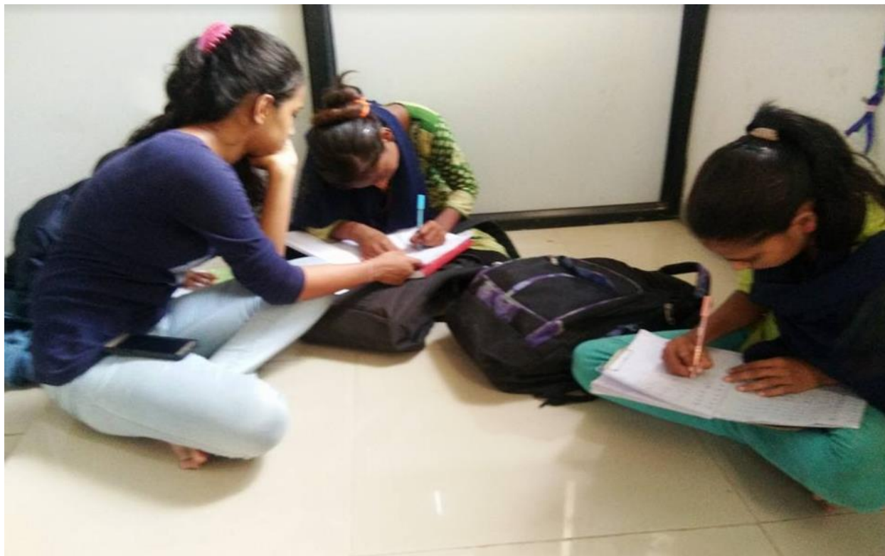
Language Lab, I2IM building