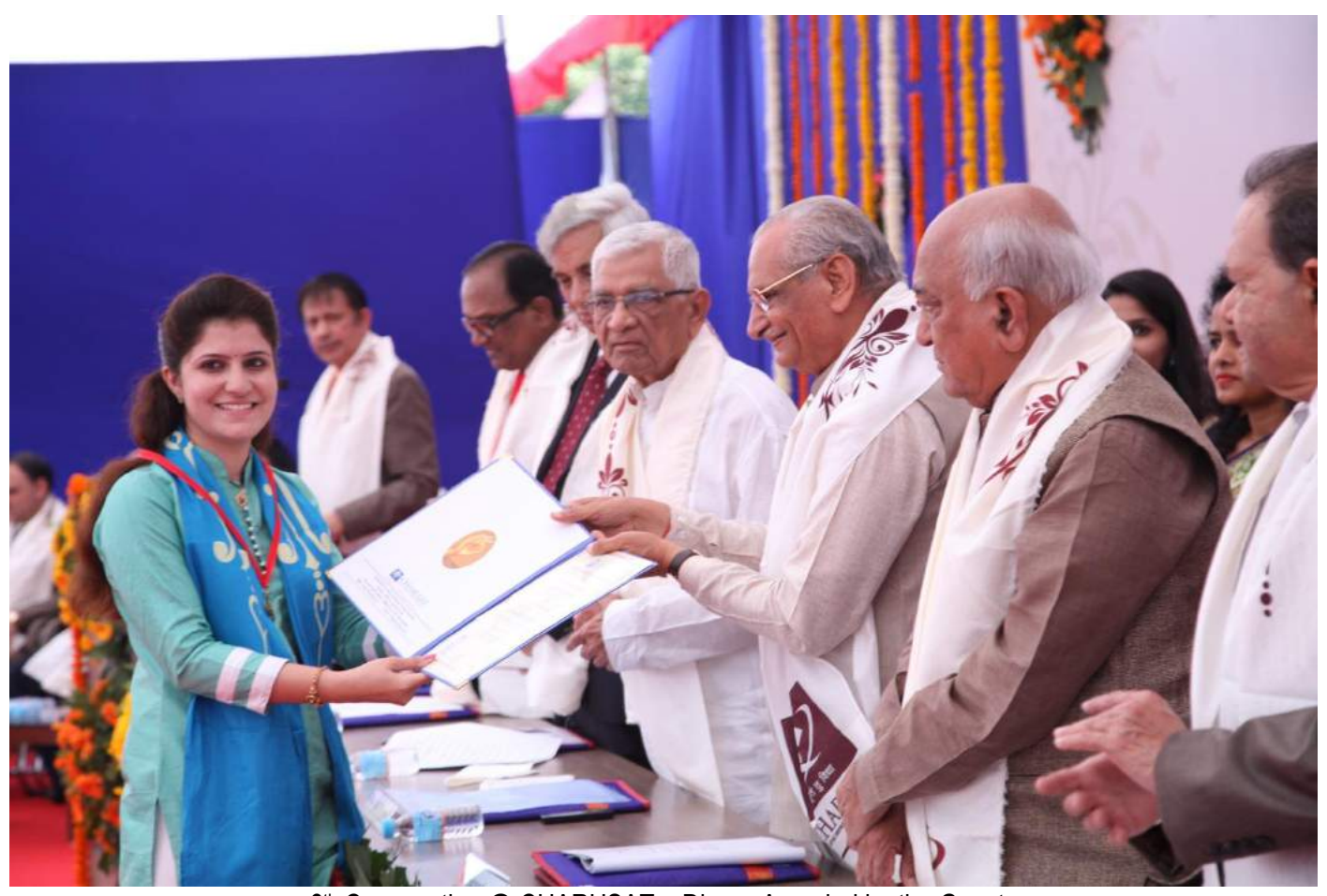
6th Convocation @ CHARUSAT - Digree Awarded by the Guests