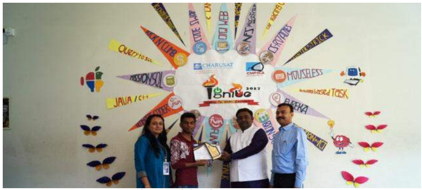
Award Ceremony @ CMPICA during Technical Festival