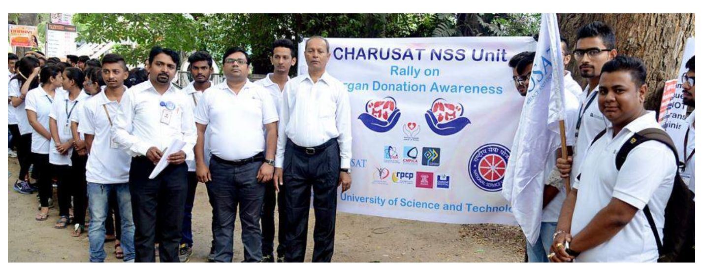
NSS Rally: Organ Donation Awareness