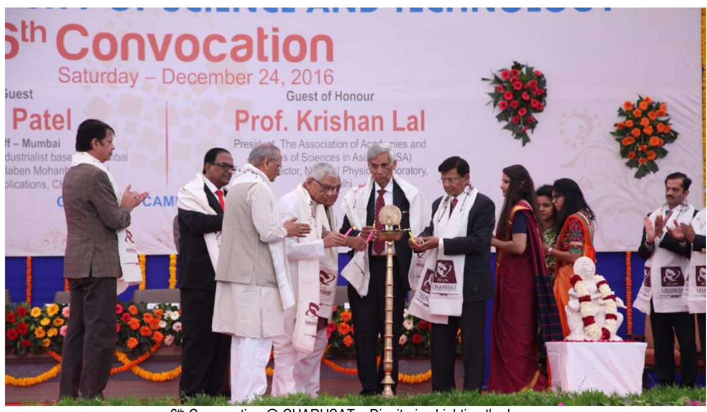
6th Convocation @ CHARUSAT - Dignitaries Lighting the Lamp