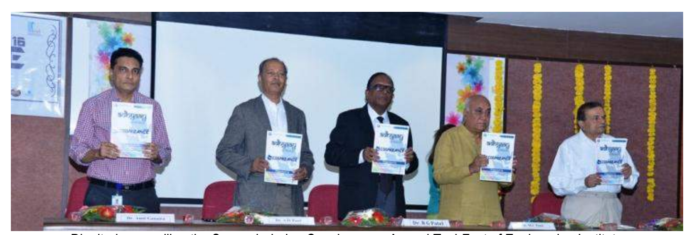
Dignitaries unveiling the Souvenir during Congizance - Annual TechFest of Engineering Institute