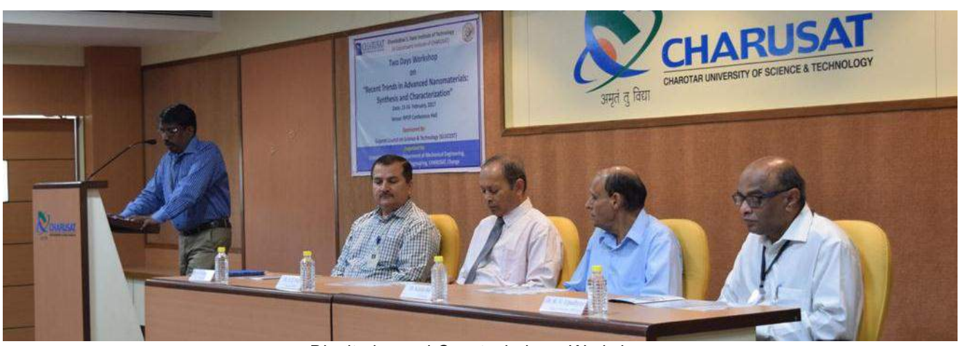
Dignitaries and Guests during a Workshop