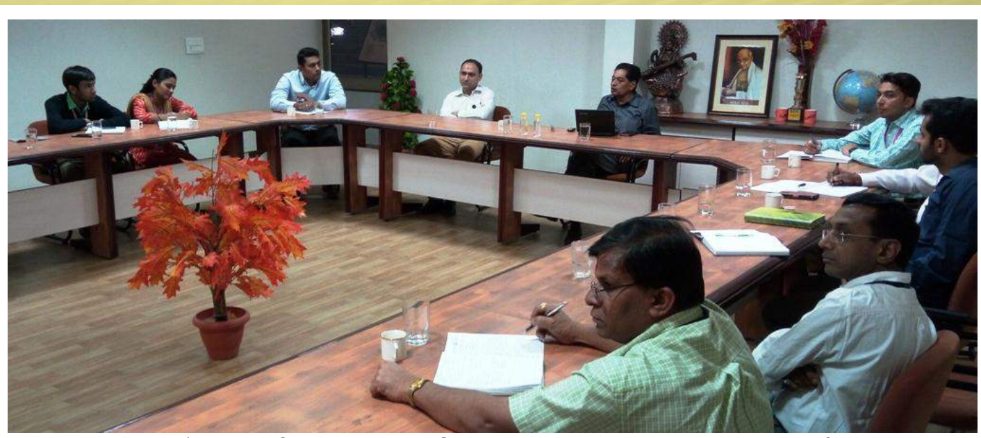
Faculty / Research Scholar Interaction @ Management Institute under the Endowment Chair