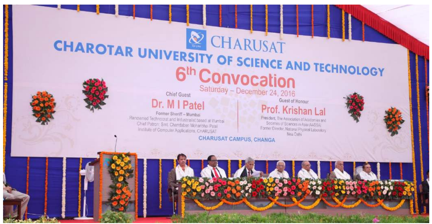
6th Convocation @ CHARUSAT - Dignitaries on the Dais