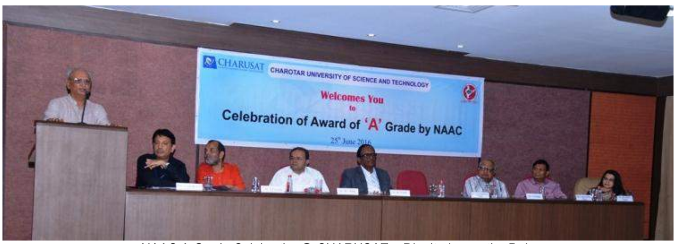
NAAC A Grade Celebration@ CHARUSAT - Dignitaries on the Dais