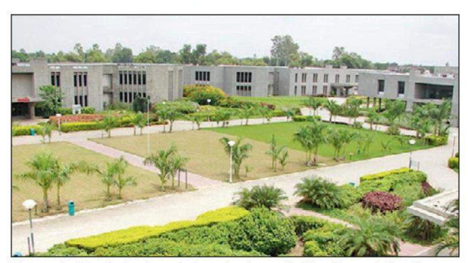
The project includes knowledge sharing activities through faculty exchange programmes between Charusat and Cardiff University

"The project has been sanctioned to enhance engineering education for Indian universities with the help of academic experts from the