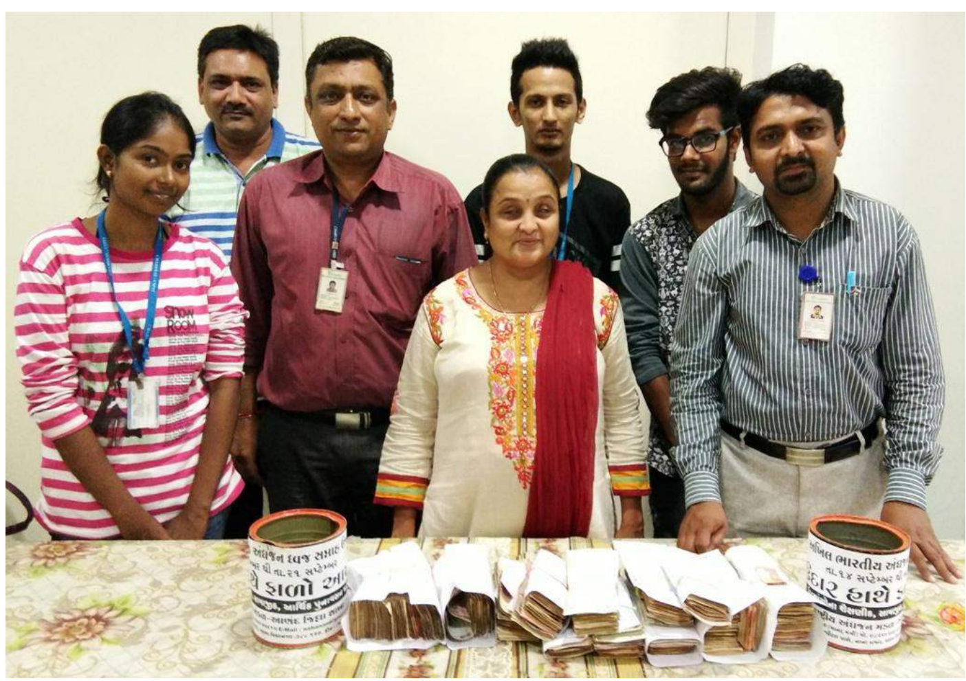
Magnanimity of CHARUSAT Family: Donation for the Blind