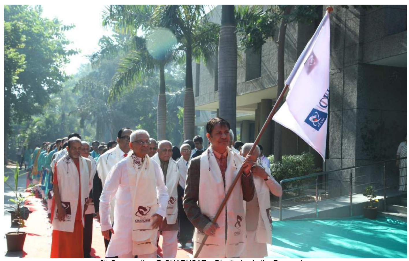
6th Convocation @ CHARUSAT – Dignitaries in the Procession