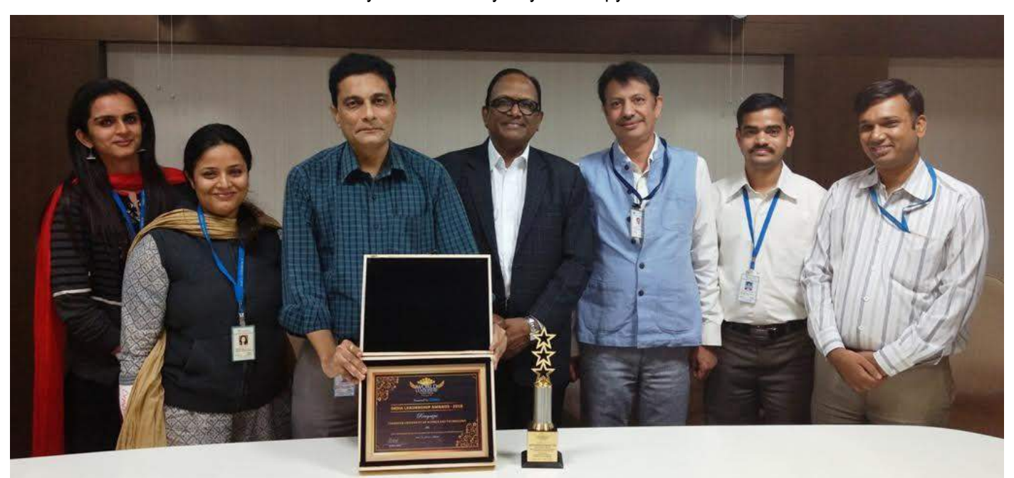
Leadership Award - "Best University in Use of Technology in Teaching - Learning Practice" in Dubai